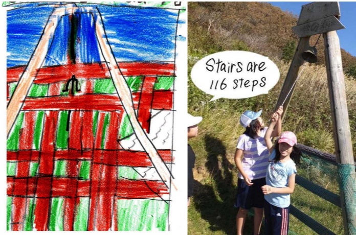
Aomori can be seen on sunny days

A beautiful sound comes out when you ring the happy bell.