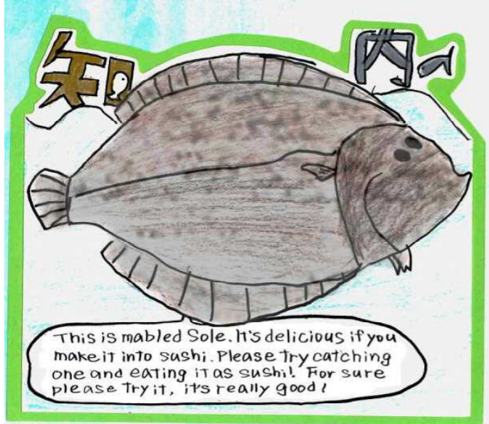
This is mabled Sole. It's delicious if you make it into sushi. Please try catching one and eating it as sushi! For sure please try it, it's really good!